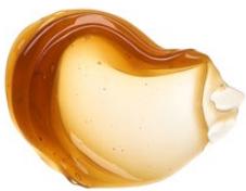
HEMP EXTRACT Cannabis sativa L.

Ingredients: AQUA, STEARIC ACID, COCO-CAPRYLATE/CAPRATE, PERSEA GRATISSIMA OIL, DIMETHYL SULFONE, CANNABIS SATIVA BIOMASS EXTRACT, CAPRYLIC/CAPRIC TRIGLYCERIDE, CETEARYL ALCOHOL, GLYCERYL STEARATE, SQUALANE, MENTHOL, CAMPHOR, METHYL SALICYLATE, SODIUM CHONDROITIN SULFATE, GLUCOSAMINE SULFATE, SORBITAN CAPRYLATE, PROPANEDIOL, BENZOIC ACID, EUGENIA CARYOPHYLLUS FLOWER OIL, SODIUM CETEARYL SULFATE, CAPSICUM FRUTESCENS FRUIT EXTRACT, ROSMARINUS OFFICINALIS EXTRACT, BRASSICA CAMPESTRIS SEED OIL, EUGENOL, ISOEUGENOL