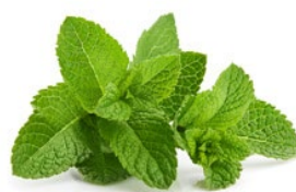
MENTHOL Mentha x piperita